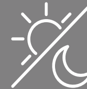
Extra payments for switching to AM/PM shift or roles