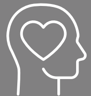
Employee Assistant Programme (EAP)