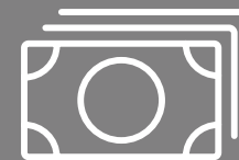
Interest Free Loans