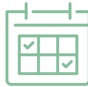
Extra payments for Short Notice Shifts