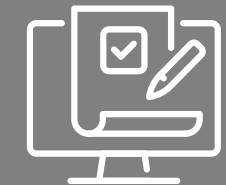
Mandatory Training Incentive