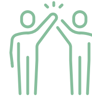
Refer a Friend Incentive