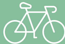
Bike Incentive & Loan Scheme